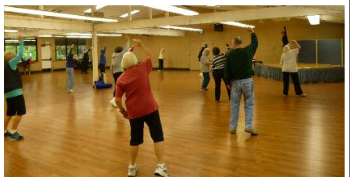
Fitness class at the Lafayette Community Center